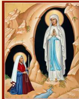
Saint Mary, Our Lady of Lourdes 5900 Kennedy Avenue Export, PA 15632 (724) 327-0647

Saturday anticipated Mass 4:00 PM Sunday Mass 11:00 AM