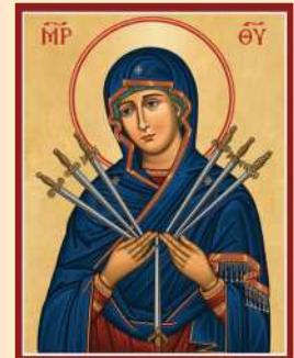
Mother of Sorrows 4202 Old William Penn Highway Murrysville, PA 15668 (724) 733-8870

Saturday anticipated Mass 4:30 PM Sunday Masses 7:30, 9:30, 11:30 AM & 6:00 PM