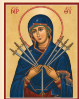
Mother of Sorrows

Saturday anticipated Mass 6:00 PM Sunday Mass 9:00 AM