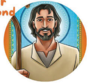
St. Peter Fishing Pond