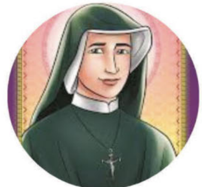
St. Faustina Masterpiece

Come and join us to learn about these saints and many more!