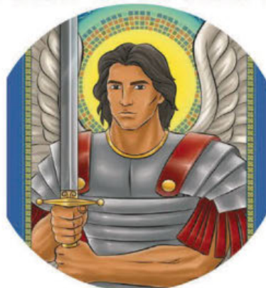
St. Michael Demon Alley