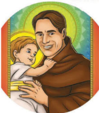
St. Anthony Key Quest

ALL FAMILIES AND PARISHIONERS ARE INVITED TO JOIN US IN THIS HOLY FUN.