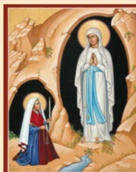
Saint Mary, Our Lady of Lourdes

Saturday anticipated Mass 4:00 PM Sunday Mass 11:00 AM