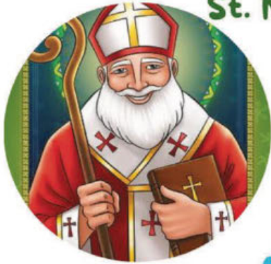
St. Nick the Gift Giver